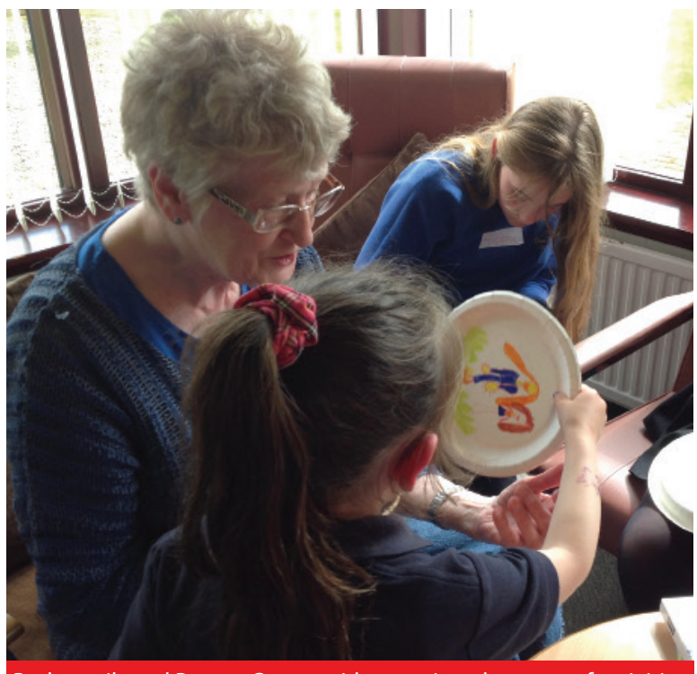
Both pupils and Boston Court residents enjoyed a range of activities during their time together

The young visitors are a group of four-year-olds who spend an hour with the tenants doing small projects like Easter egg biscuit decorating.