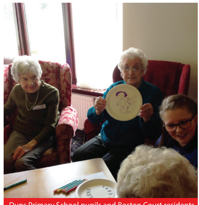
Duns Primary School pupils and Boston Court residents enjoyed the visits