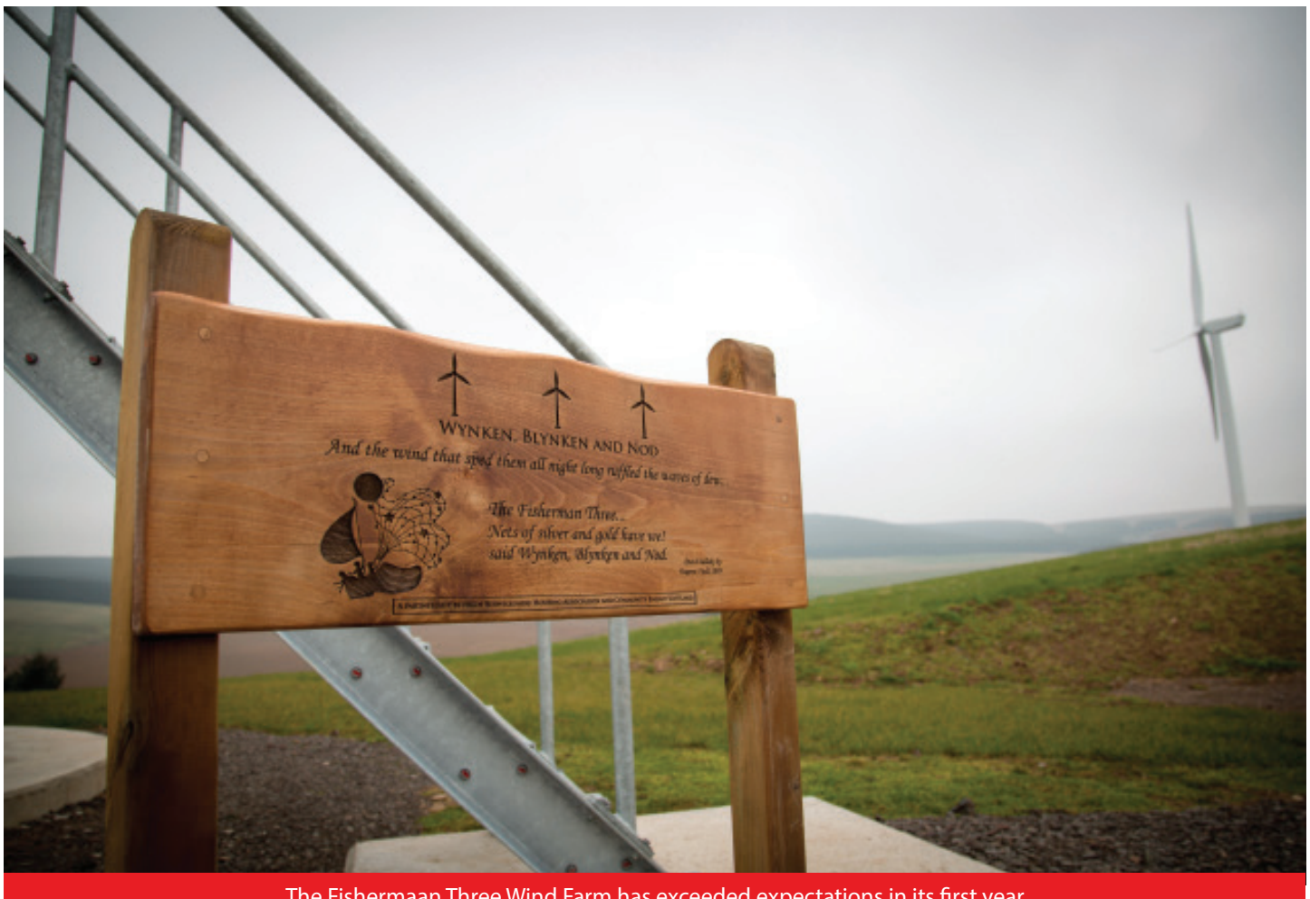
The Fishermaan Three Wind Farm has exceeded expectations in its first year

Berwickshire's innovative and awardwinning Fisherman Three Wind Farm, has exceeded all expectations in its first year of operation.