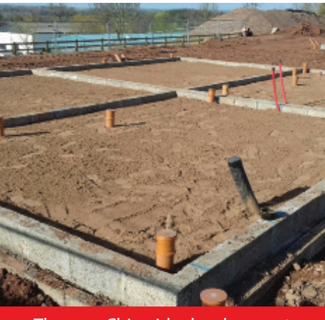
The new Chirnside development is underway

We have to wait until the planning process is complete before finalising any programme, but we are hopeful that we could be on site later this year.