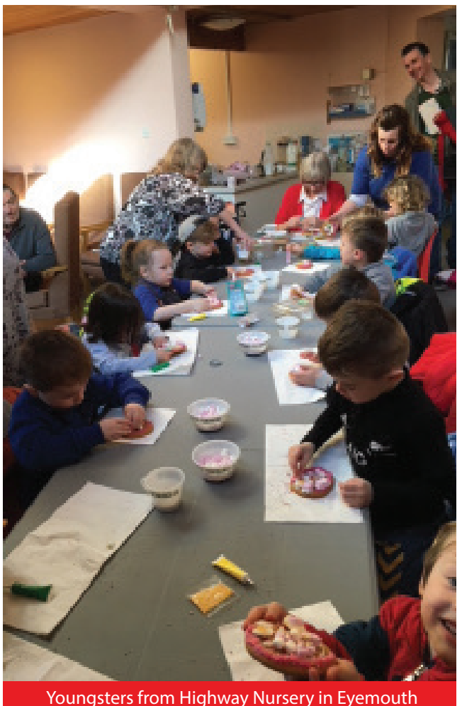
make decorated Easter biscuits at Linkim Court